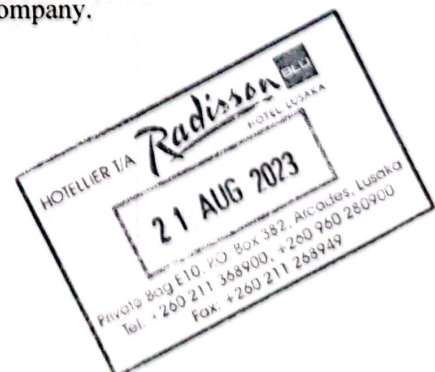
Amanda Mwenda Human Resources Manager

Radisson Blu Hotel, Lusaka Plot 19029 Great East Road, Private Bag E10, Box 382, Arcades, Lusaka, Zambia T: +260 211 368900 F: +260 211 368949 info.lusaka@radissonblu.com radissonblu.com/hotel-lusaka